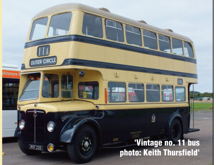
'Vintage no. 11 bus '

This year is the 90 year anniversary of the opening of Acocks Green Bus depot, the home of the famous no.11 bus. To mark this occasion National Express are organising an Open Day at the depot on Westley Road on Saturday 23rd June from 10.30am to 3.30pm. As well as stalls and family-friendly activities they will be running some vintage buses along part of the number 11 route. All proceeds will go to a local charity. Keep an eye out for more information.